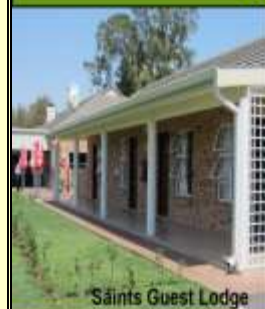
Saints Guest Lodge

Below are the half day and full day rates for conferences in the main conference centre.