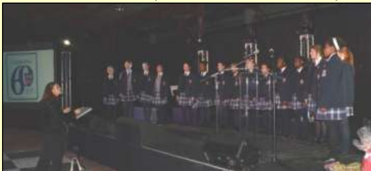
Amazwi Africa Girls' College Choir