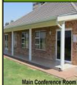
Main Conference Room

The One & All Club at St Stithians College offers conveniently located conference facilities, seating up to a maximum of 100 delegates in our purpose-built conference centre, adjacent to Higher Ground Restaurant. Situated in private and secure surroundings of St Stithians College, the conference centre has its own deck and enjoys an amazing view over the Sandton skyline.