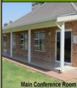
Main Conference Room

The One & All Club at St Stithians College offers conveniently located conference facilities, seating up to a maximum of 100 delegates in our purpose-built conference centre, adjacent to Higher Ground Restaurant. Situated in private and secure surroundings of St Stithians College, the conference centre has its own deck and enjoys an amazing view over the Sandton skyline.