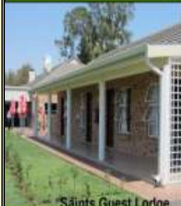
Saints Guest Lodge

Below are the half day and full day rates for conferences in the main conference centre.